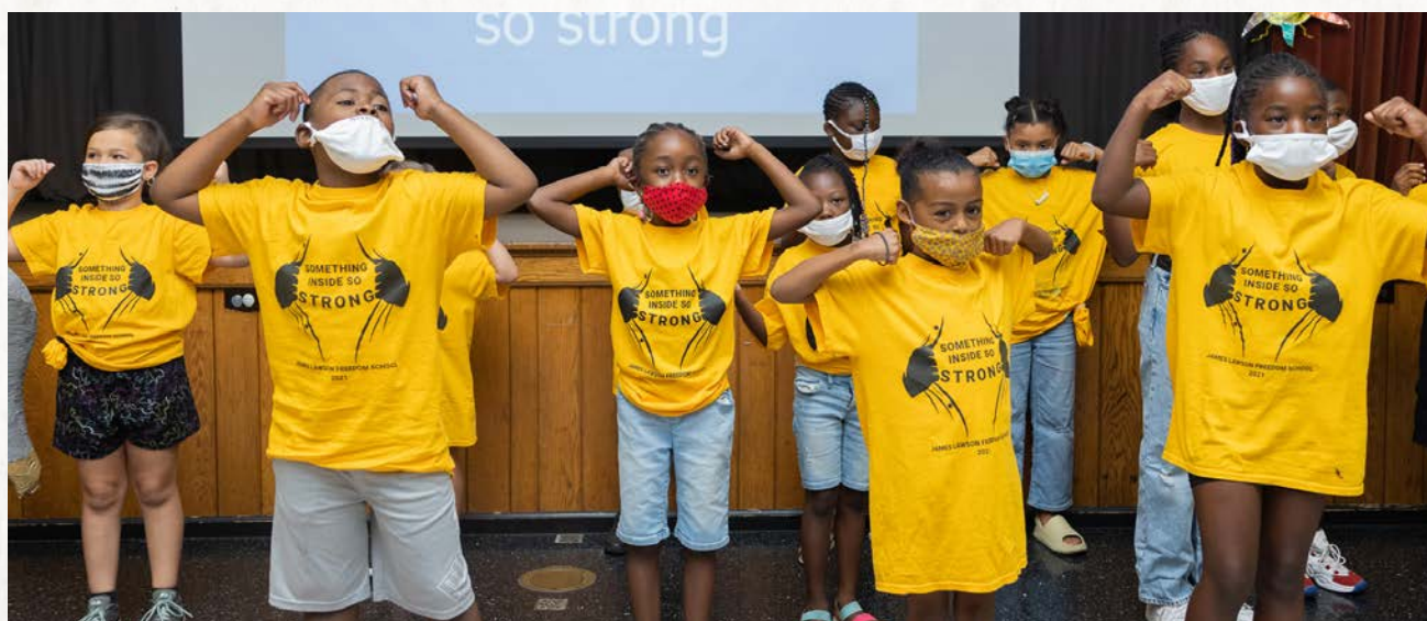
James Lawson Freedom Schools