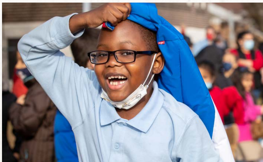
Roosevelt Elementary School, Allentown Pa.